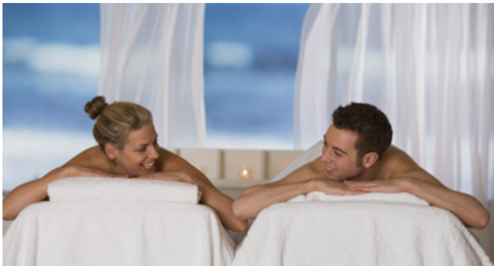
Describing the benefits you get from massage therapy could convince others to try it.

massage, where two people receive massage in the same room, could be an anniversary gift.