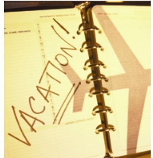
Staying healthy is key to a good vacation.

By packing a few natural remedies and paying attention to your body's needs, you'll be able to fully enjoy your trip.